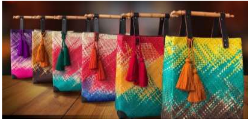
Figure 2: The Pandan-Woven Bags