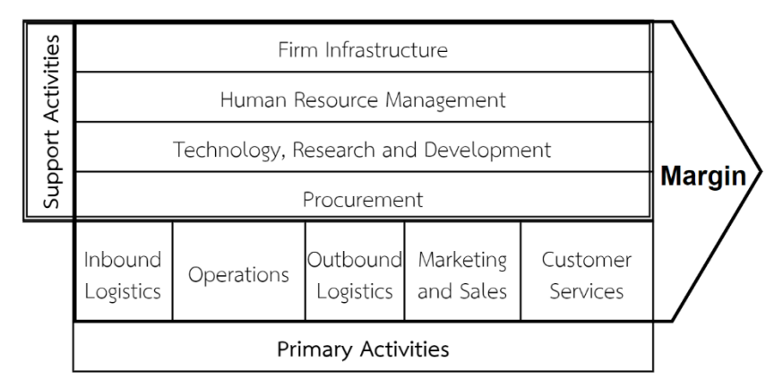
Figure 1 Value chain analysis

point of activities (Srisom, 2010) although it able to measure current status of organization and determine the direction to be better in the future (Jones & Womack, 2002) the analysis of industrial value chains can also help policymakers used as a conceptual framework in response to the integration of consistent and coherent activities (Dahlstrom & Ekins, 2005). Value chain analysis methods can be performed in several ways. And there are no strict rules on proceed A quantitative analysis for comparison (McCormick & Schmitz, 2001) used questionnaires to understand those involved in the value chain. This is another method that can be done (Zamora, 2016), the analysis of the value chain is shown in Figure 2.