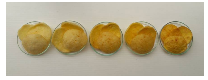
Figure 1. Fish crackers from surimi supplemented with pumpkin The ratio of cassava starch to pumpkin as following (A) 93:7, (B) 89:11, (C) 85:15, (D) 81:19 and (E) 77:23