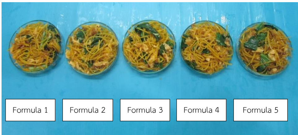
(c) Fried Betong Instant Noodle ready to eat