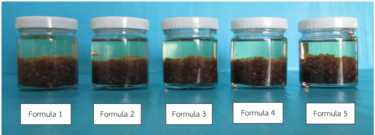
(a) Seasoned Sauce