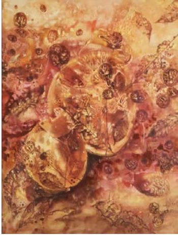
Picture 15: The painting titled “the rubber seeds in the garden” (05)