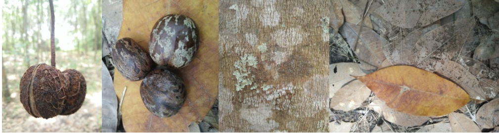
Picture 1: The features of the rubber seeds, textures and patterns of the rubber stems, and dried rubber leaves.

collected books, internet, and field visits in Na Pradu sub-district, Khok Pho district, Pattani province. The information was then analyzed and selected based on reliable sources, such as the preliminary information on the components of rubber trees and seeds, and the features of shapes, forms, colors, and textures etc.