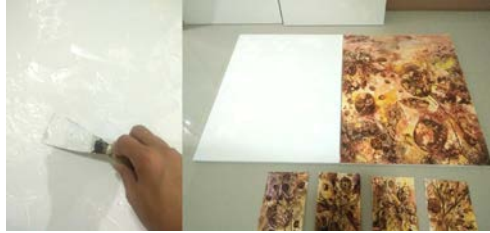
Picture 6: The creation of textures and shapes with acrylic painting