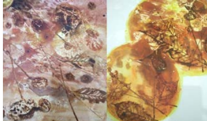
Picture 10: The overview of acrylic painting with leaf or branch printing techniques