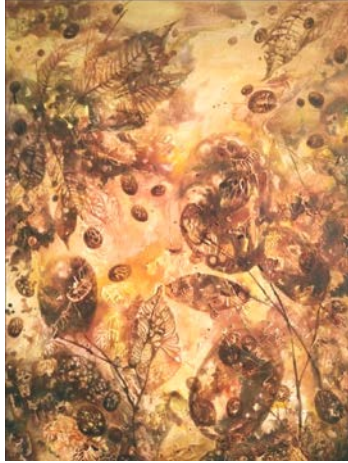
Picture 11: The painting titled “the beauty of rubber seeds in rubber forests” (01)