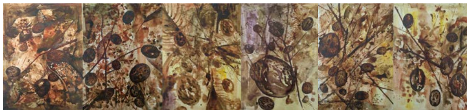
Picture 3: The sketch artwork with watercolor painting techniques, natural material's painting, and black ink drawing

2.2 The sketching step: Analyze and synthesize the research information to prepare for the sketching process by applying watercolor painting techniques, the printing of natural materials, and black ink drawing to try making the textures and atmospheres. The sketches applied color scheme patterns that will be used in the artwork.