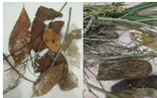
Picture 7: Prepare natural materials to create leaf or branch prints with acrylic painting