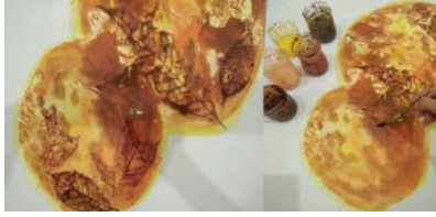
Picture 9: Painting with leaf or branch printing techniques and the coloring the surface similar to watercolor painting technique