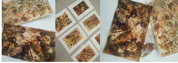
Picture 2: The sketch artwork with watercolor painting technique, rubber leaf prints, and black ink drawing