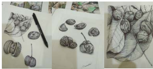
Picture 2: The sketch artwork of the rubber seeds' structure through black ink illustration

2.1 The sketching step: Analyze and synthesize the research information to prepare for the sketching process by using black ink illustration technique to create shapes, forms, textures, and atmospheres. The sketches are curtailed from of the natural shapes collected from the study.