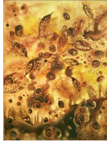
Picture 12: The painting titled “the beauty of rubber seeds on the soil” (02)